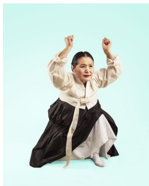
Min Kim Park Contrived Spectacle

We are seduced and affronted in equal measure. The alluring Victorian styled wall paper evokes traditional female roles of home-maker and sex object, especially when looking closely at the vulva shaped pattern. Juxtaposed is the incessantly repeated and ornately scripted word 'cunt,' inviting contemplation on issues such as the insidious aggression towards women and the pervasive objectification and domination of women's bodies.