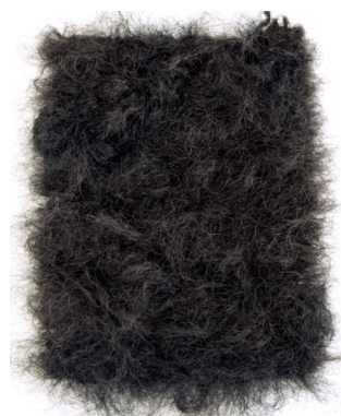
Nastassja Swift Now You Can Touch My Hair

Reflects the disorder in the current world order that values work outside the home more than work performed inside the home. Maintaining a household and raising children is just as demanding and challenging as many professions outside the home, but with no system of built-in monetary compensation the work is sociologically and psychologically undervalued.