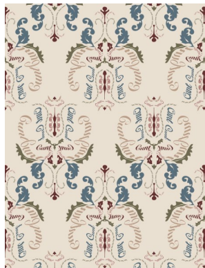
SPOOKY BOOBS COLLECTIVE You Stupid Cunt

This portrait being more emotionally charged, it is meant to drive you to a place deep within yourself, much like the subject appears beneath the depth of the water. The darkness of the water, coupled with whether she is rising or falling, creates a sense of insecurity amidst the obvious presence of the unknown. Yet her face thrives with vibrant color and intensity that could only represent self awareness and victory over adversity and conflict.