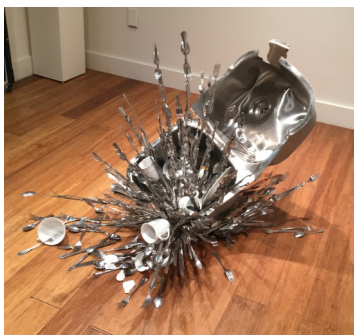
Lynn Dau Disorder

Contrived Spectacle features Korean women in their traditional cotton jacket and skirt in various poses and gestures from their everyday activities such as washing the laundry, babysitting with baby in their back, working in the field. However, these poses also bear the symbolic images of the ideal Korean women (or mother) as passed down from past generation and structuralized within the society as the bearer of nobility, selfless sacrifice, compassion and beauty.